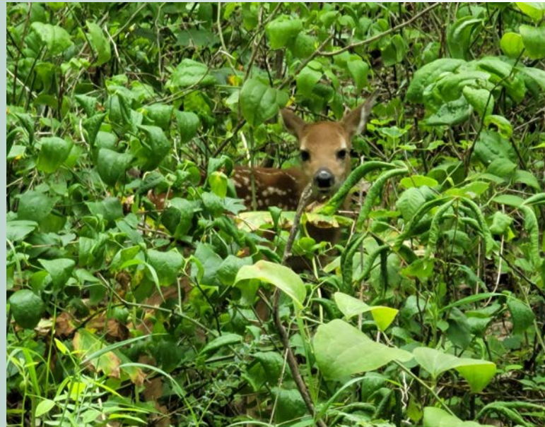
A fawn visited the work crew while building the reroute.