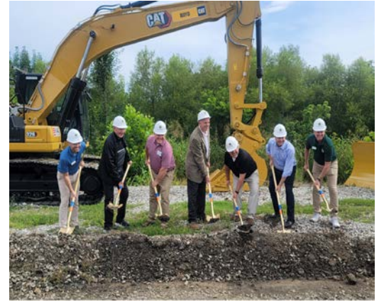
Local leaders from five southern Indiana counties gathered at Borden Community Park this past July to mark the expansion of the Monon South Trail, which comes within a quarter of a mile of the southern terminus of the Knobstone Trail.

The Monon South passes within a quarter of a mile of the southern terminus of the KT. With connections to community trails in the metropolitan area, it will be possible to hike from downtown Louisville to the KT. If similar efforts succeed at connecting to urban trails in the north, it should be possible to hike all the way to downtown Indianapolis.